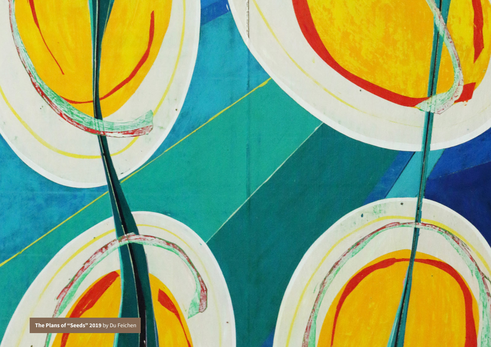
The Plans of "Seeds" 2019 by Du Feichen